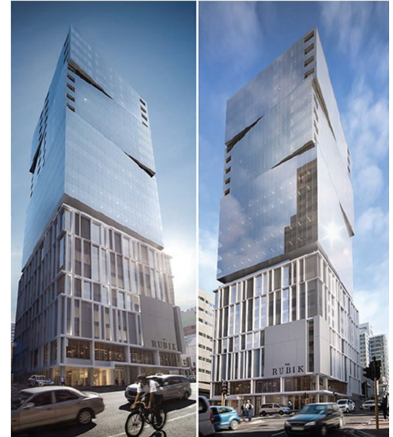
The Rubik Office Project